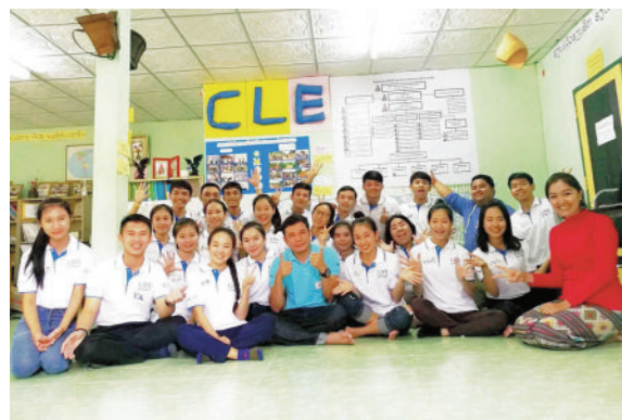
CLE students after LIFE coaching session.

Youth are another stakeholder group that the project could seek to engage with in the future. This could be done by working with the Faculty of Law and Center for Legal Education or youth groups. Young people represents the majority of the Laos’ population and the youth are the key to securing long lasting changes in behavior and practices at the community level.