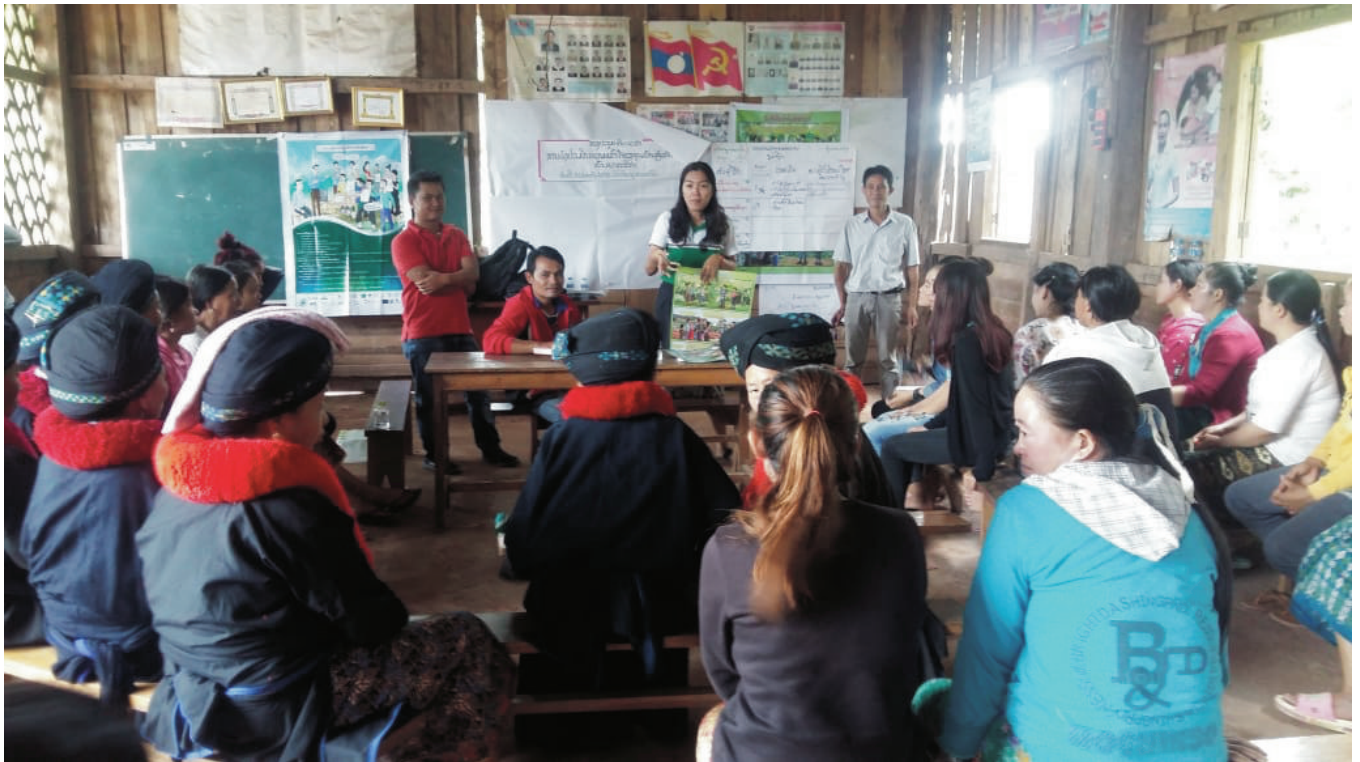
LIFE coaching in Luang Namtha province.