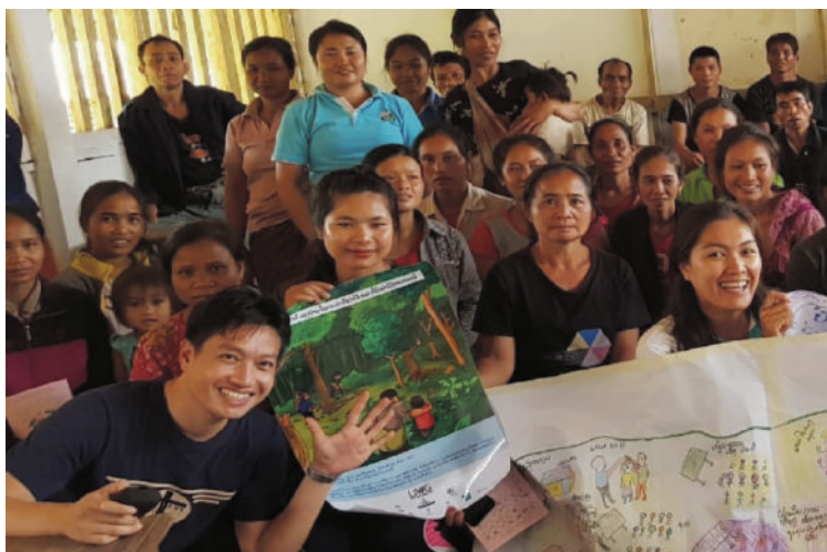
LIFE coaching in Luang Namtha province.

*Quotes are from responses to a survey sent to staff of 30 partner organizations in 2017.