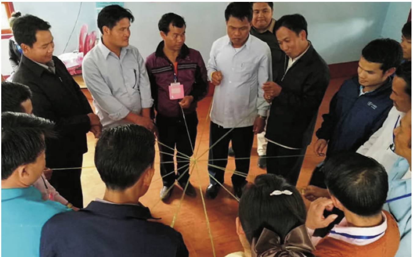
A pilot training on "Access to Justice" module in Paksong in January 2018.

*Quotes are from responses to a survey sent to staff of 30 partner organizations in 2017.