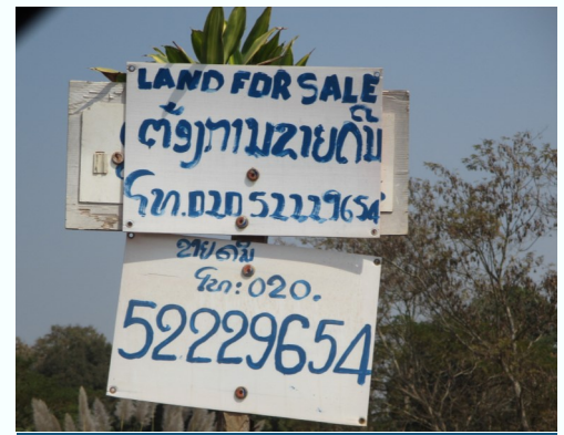
Land for sale along 450 year road

The final version of the report will be available soon.