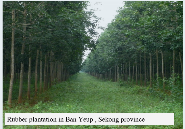
Rubber plantation in Ban Yeup , Sekong province