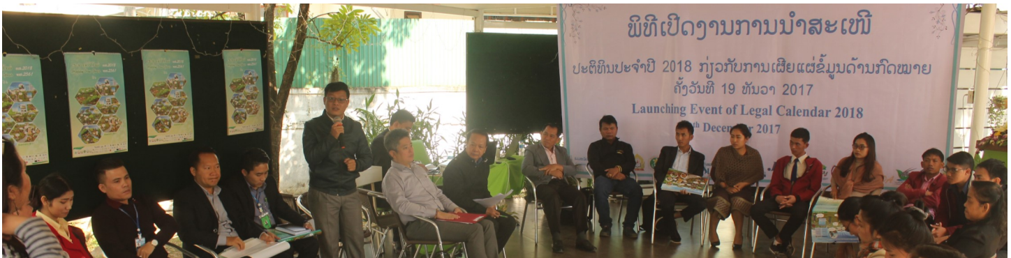
Discussion among participants for using legal calendar 2018