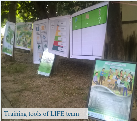
Training tools of LIFE team

The Land learning Initiative for Food security Enhancement (LIFE) under the LIWG organized a community of Practice Workshop on November 28, 2017 at Learning House, Vientiane.