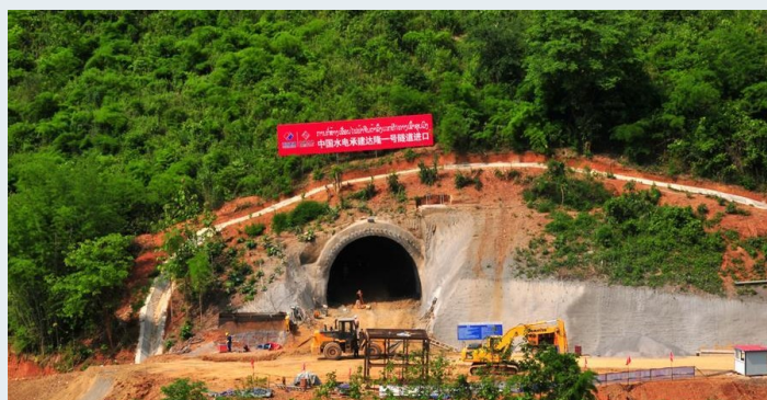
A tunnel of China-Laos railway under construction in northern Laos' Luang Prabang Province.