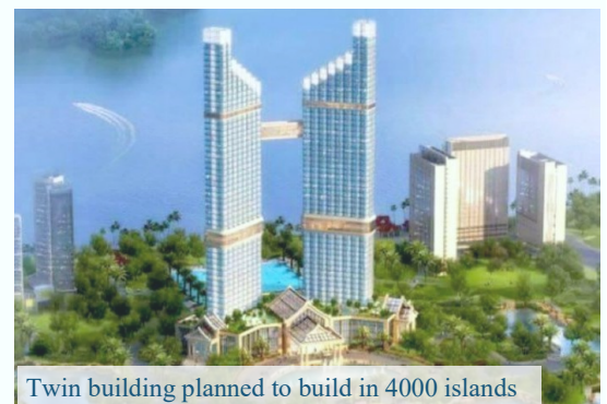
Twin building planned to build in 4000 islands

Read more here and see the video of the master plan of this SEZ (scroll down from the top to see video) here .