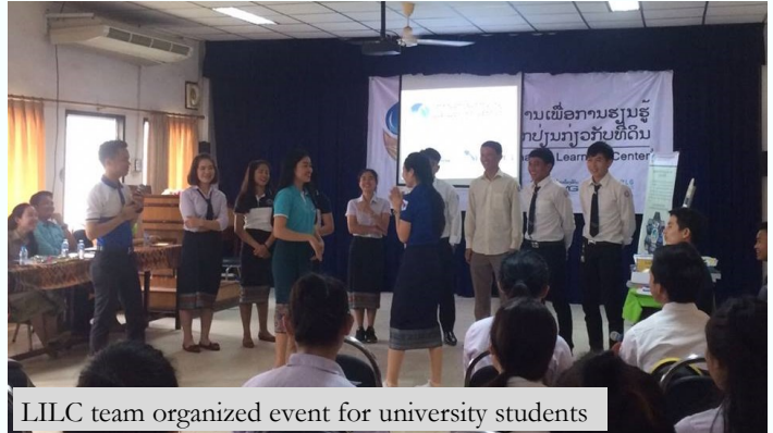
LILC team organized event for university students

Note: In the previous quarterly , the name of this learning center was not finalized, so we used LLRC as a reference. Now it is officially named Land Information Learning Center (LILC)