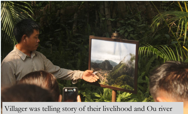
Villager was telling story of their livelihood and Ou river