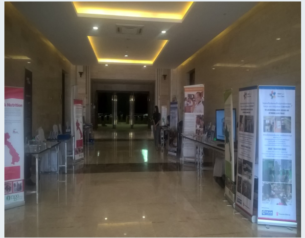
Booth presentation from INGOs network at MOFA Conference

From the meeting , Mr Saleumxay Kommasith, Minister of Foreign Affairs said "INGOs and civil society organizations are important for the development of our country and the work they do to reduce poverty by partnering with the government to carry out development plans and fulfill the Sustainable Development Goals."