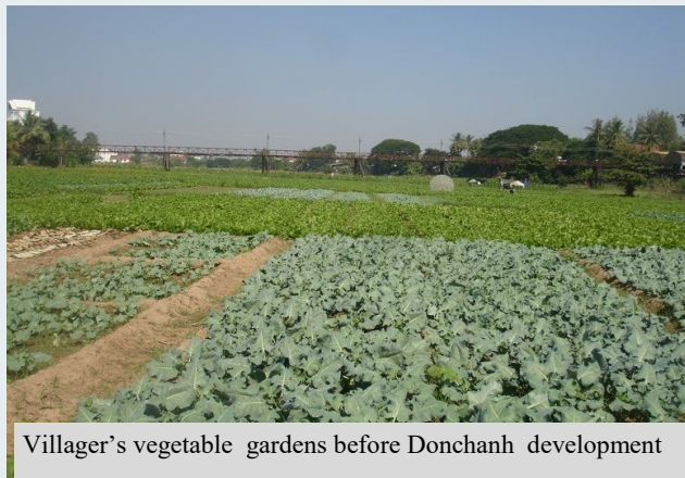
Villager's vegetable gardens before Donchanh development

On the 14 th March 2018, Helvetas organized an exchange session for the US public health students from Khon Khaen Public Health University, Thailand. This exchange session covering different topics such as land issue and food security, nutrition, pesticide etc... related to the health of people.