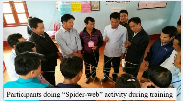
Participants doing "Spider-web" activity during training

From 22-26 January 2018, LIFE organized the coaching for Ministry Of Justice. The coaching was held in Paksong, Champasak province and officials from different divisions from provincial and district levels attended the coaching. This was the first time for LIFE team to organize training for Ministry of Justice, and the topic for this coaching was "Access to Justice". In the training, the LIFE team used different methodologies during the lesson so the atmosphere of the training was interactive, especially using tools to analyze the problem and connect them to laws. Beside this, participants also gained new skill on Training of Trainer (ToT) which they have never been trained on before.