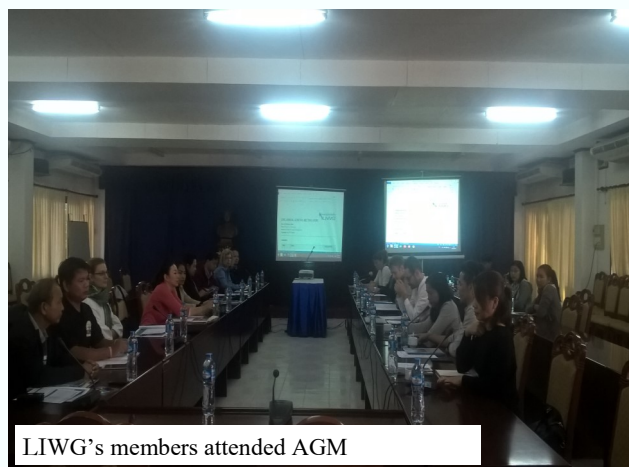
LIWG's members attended AGM

This meeting was also the chance for secretariat and members to discuss how to build strong network for land advocacy and how to sustain the network in the sustainable way such as expectations from members (i.e. dissemination of information, facilitating experience and knowledge sharing).