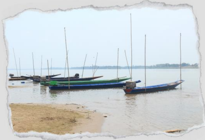
The village head of Naphan emphasizing the importance of doing the fish conservation.

“We used to see many fish species in the past, but now they are disappearing. When the project team from WWF Laos came to our village and raised awareness on the importance to protect those existing species, we all agreed to be part of this project to do in our village territory. We really hope that from doing it we can protect the existing fishes and increase the fish population so that our children can have a sustainable source of food security in the future.