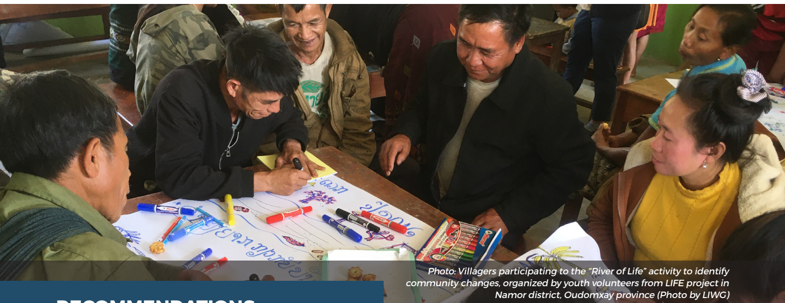
Photo: Villagers participating to the "River of Life" activity to identify community changes, organized by youth volunteers from LIFE project in Namor district, Oudomxay province (Photo by LIWG)