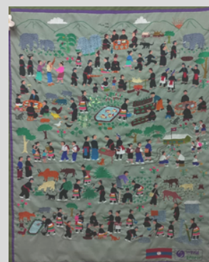
Lao People Livelihood Evolution Roadmap