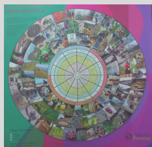
Cultural Calendar of the RSHI People

Please access to https://bit.ly/3ANmLQR .