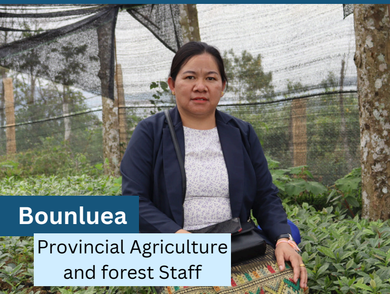
Bounluea Provincial Agriculture and forest Staff

“As a provincial government employee, I was very pleased to visit these villages and witness the successful implementation of the project. Since the project's arrival, I've observed a significant increase in awareness among villagers regarding the importance of agricultural production for generating sufficient income to support their families. On behalf of the Provincial Department of Agriculture and Forestry, I want to reiterate our commitment to providing ongoing technical support. Moving forward, we would like to see continued support in the form of budget, improved techniques, and equipment to enhance the villagers' capacity for sustainable agriculture and ensure the project's long-term success.”